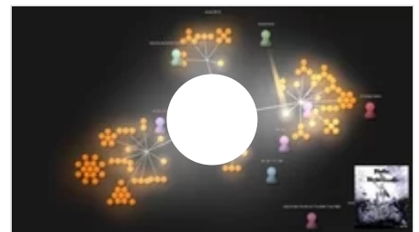
Visualization of the collaborative work in the German wiki project Mathe für Nicht-Freaks

WikiNodes are pages on wikis that describe related wikis. They are usually organized as neighbors and delegates. A neighbor wiki is simply a wiki that may discuss similar content or may otherwise be of interest. A delegate wiki is a wiki that agrees to have certain content delegated to that wiki. [49] One way of finding a wiki on a specific subject is to follow the wiki-node network from wiki to wiki.