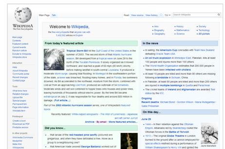
The home page of the English Wikipedia

The English Wikipedia has the largest user base among wikis on the World Wide Web [33] and ranks in the top 10 among all Web sites in terms of traffic. [34] Other large wikis include the WikiWikiWeb , Memory Alpha , Wikivoyage , and previously Susning.nu , a Swedish-language knowledge base. Medical and health-related wiki examples include Ganfyd , an online collaborative medical reference that is edited by medical professionals and invited non-medical experts. [12] Many wiki communities are private, particularly within enterprises . They are often used as internal documentation for in-house systems and applications. Some companies use wikis to allow customers to help produce software documentation. [35] A study of corporate wiki users found that they could be divided into "synthesizers" and "adders" of content. Synthesizers' frequency of contribution was affected more by their impact on other wiki users, while adders' contribution frequency was affected more by being able to accomplish their immediate work. [36] From a study of thousands of wiki deployments, Jonathan Grudin concluded careful stakeholder analysis and education are crucial to successful wiki deployment. [37]