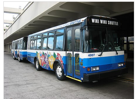
Wiki Wiki Shuttle at Honolulu International Airport

WikiWikiWeb was the first wiki. [14] Ward Cunningham started developing WikiWikiWeb in Portland, Oregon , in 1994, and installed it on the Internet domain c2.com on March 25, 1995. It was named by Cunningham, who remembered a Honolulu International Airport counter employee telling him to take the " Wiki Wiki Shuttle " bus that runs between the airport's terminals. According to Cunningham, "I chose wiki-wiki as an alliterative substitute for 'quick' and thereby avoided naming this stuff quick-web." [15][16]